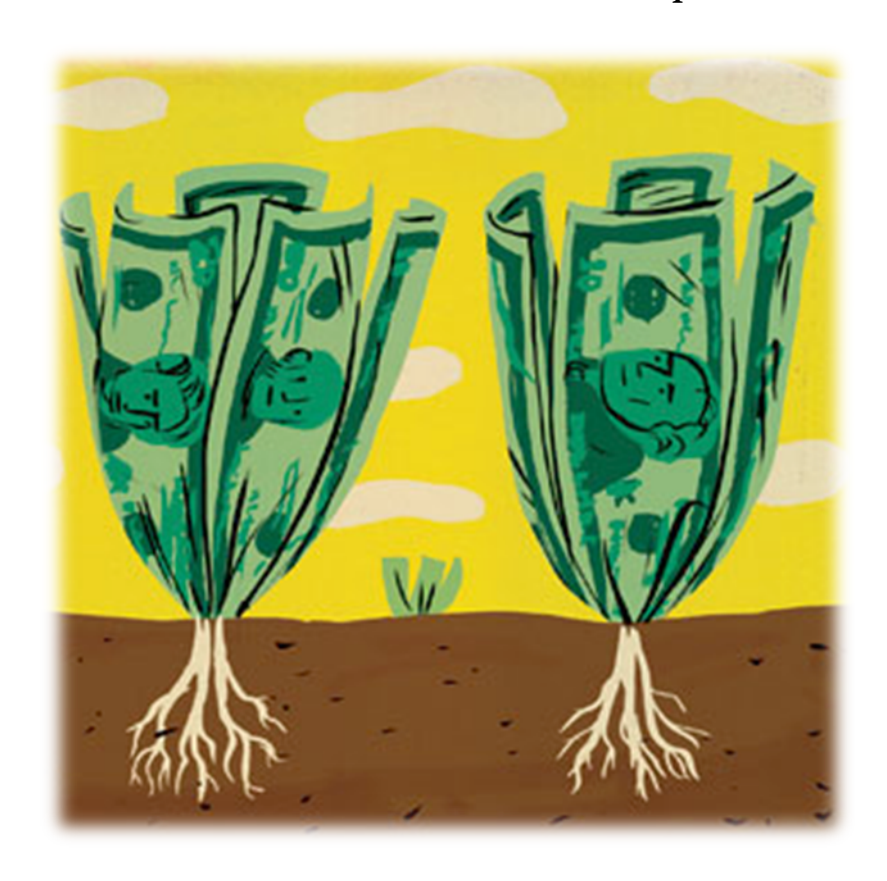
A Guide to the Many Loan and other Financing Options Available to Small Businesses and Low-Income Entrepreneurs