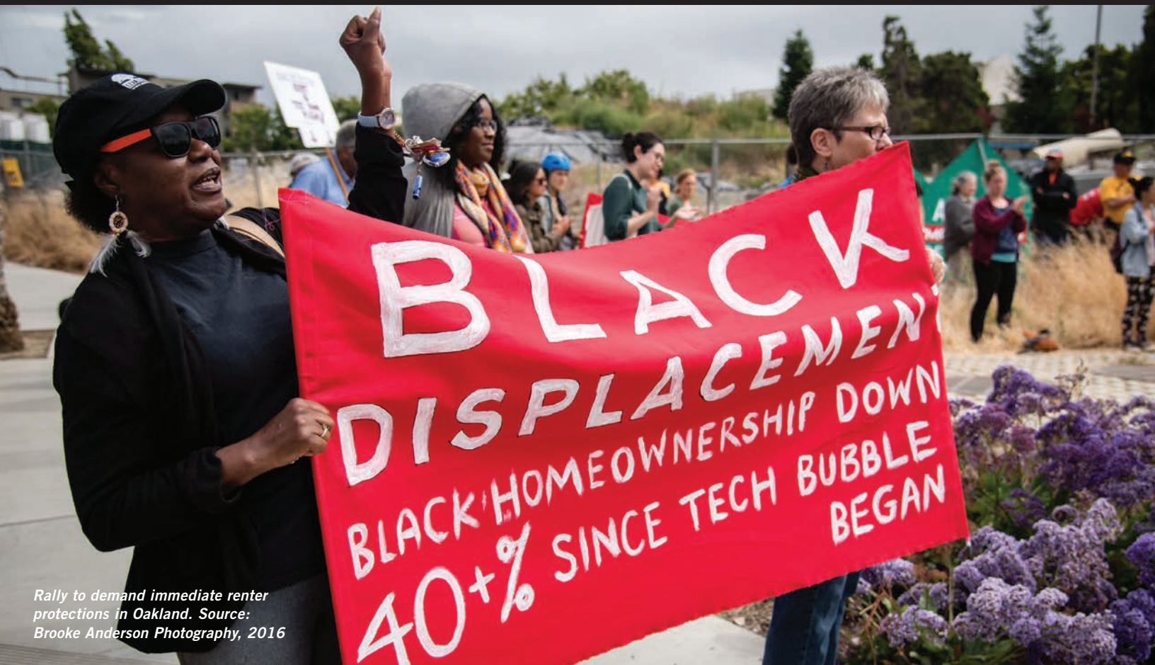
Rally to demand immediate renter protections in Oakland.

commodities will never adequately meet the needs of low-income and working class communities. We must replace this market economy with a moral economy that is attuned to what people need and is shaped by our vision for stable, healthy, democratically controlled communities. This is what we mean by decommodification.