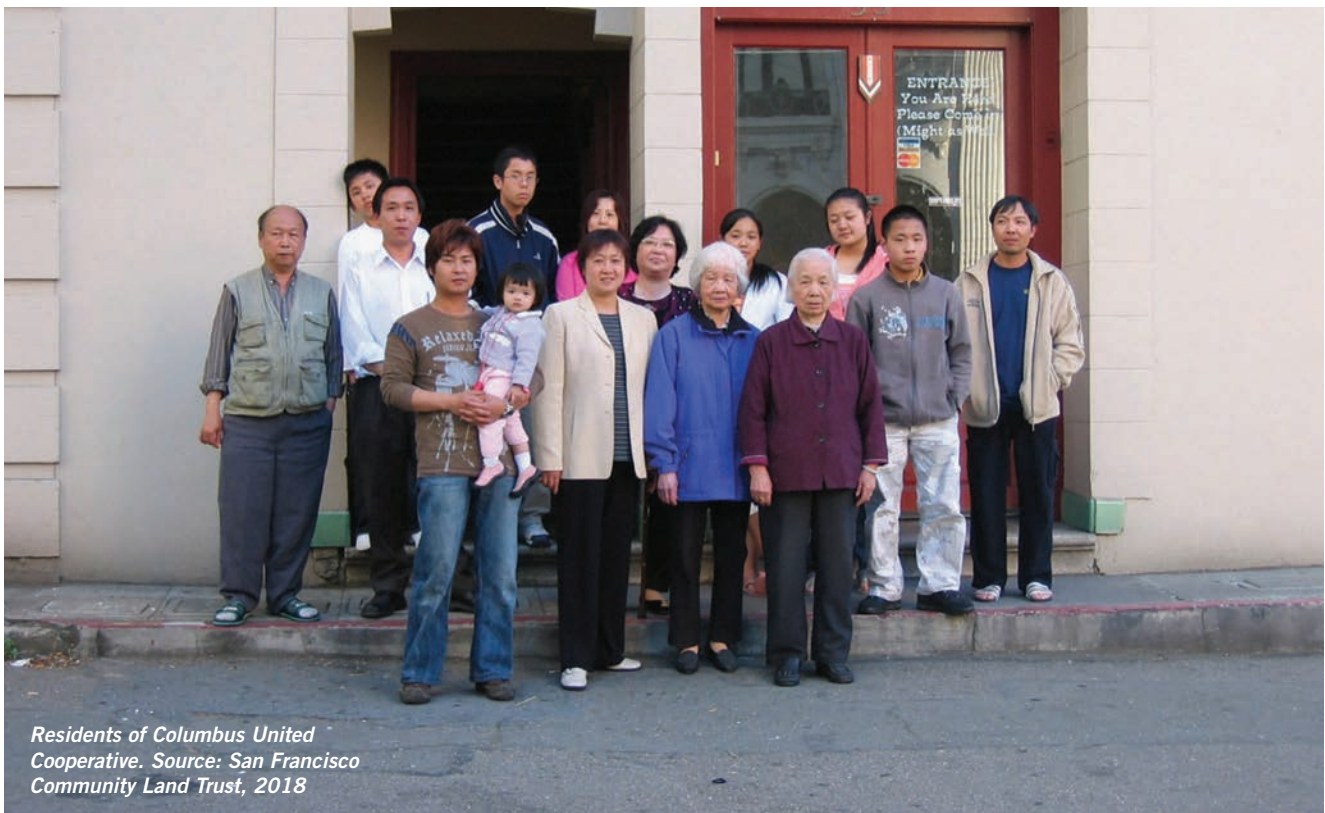
Residents of Columbus United Cooperative.