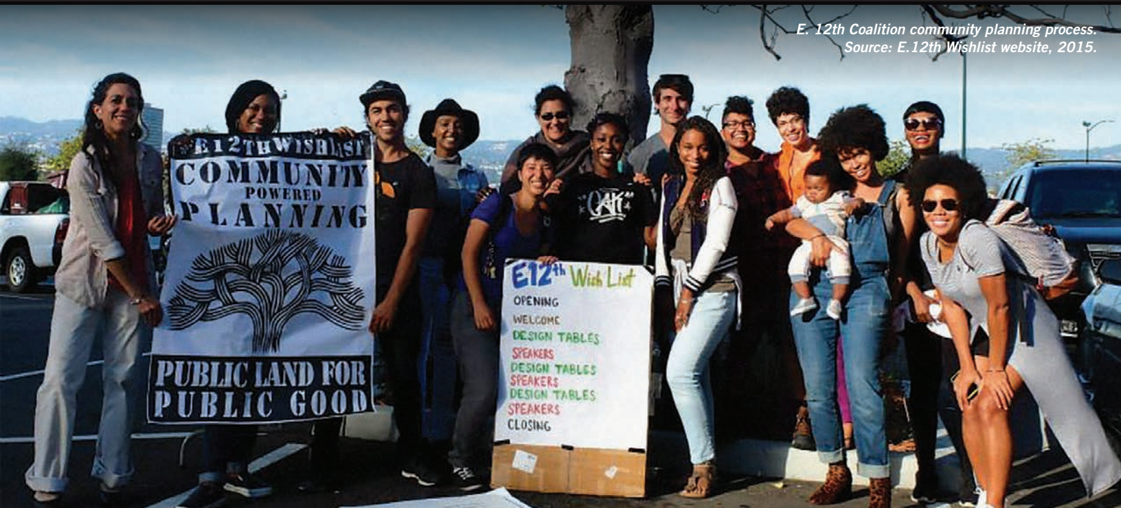
E. 12th Coalition community planning process.

is no longer necessary for the entity's use). 63 Since then, San Francisco, for example, has adopted a detailed procedure for the disposition of public land. In Oakland, on the other hand, community-based organizations have accused the City of violating the Act, and the City has yet to pass a comprehensive public land ordinance that is agreeable to both City and community representatives. 64 San Jose has asserted that as a charter city, as opposed to a general law city, it maintains power over its local affairs and is not subject to the Act. 65