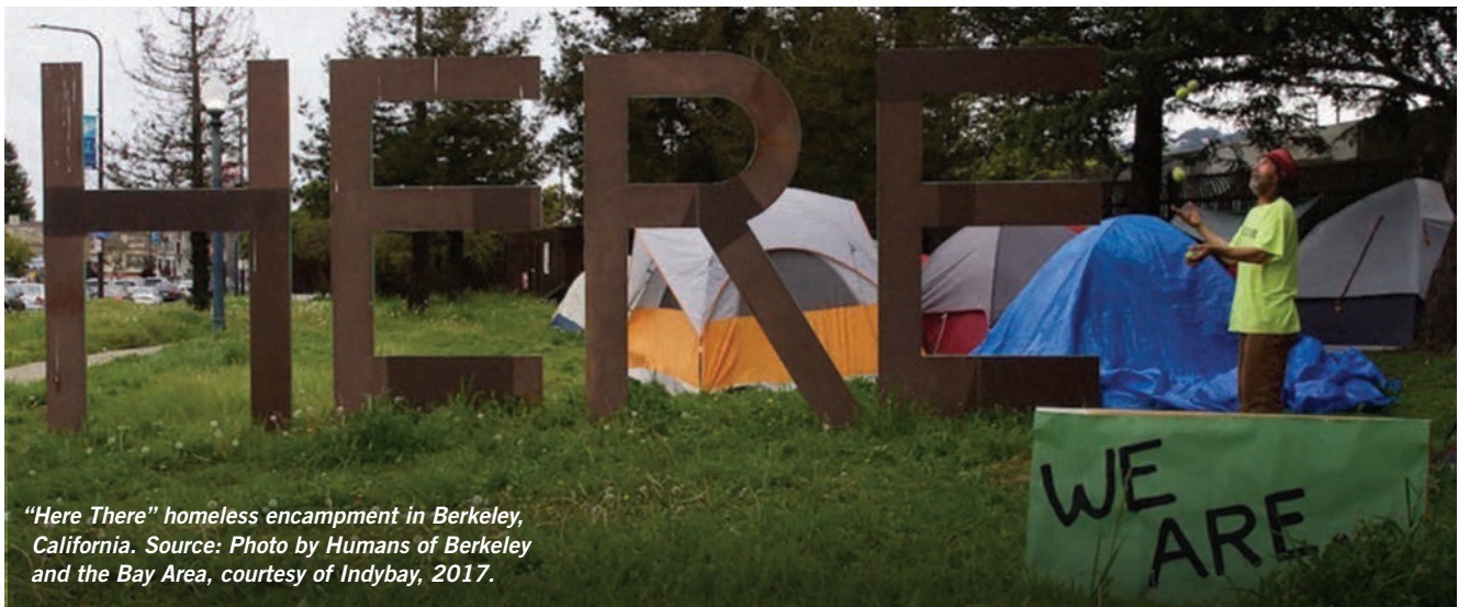
"Here There" homeless encampment in Berkeley, California.

First They Came for the Homeless (FTC) is a politically oriented community of unhoused residents in Berkeley that has been organized and active since 2014, though the group originally came together in the aftermath of the 2008 recession. 18 FTC membership encompasses a range of people who