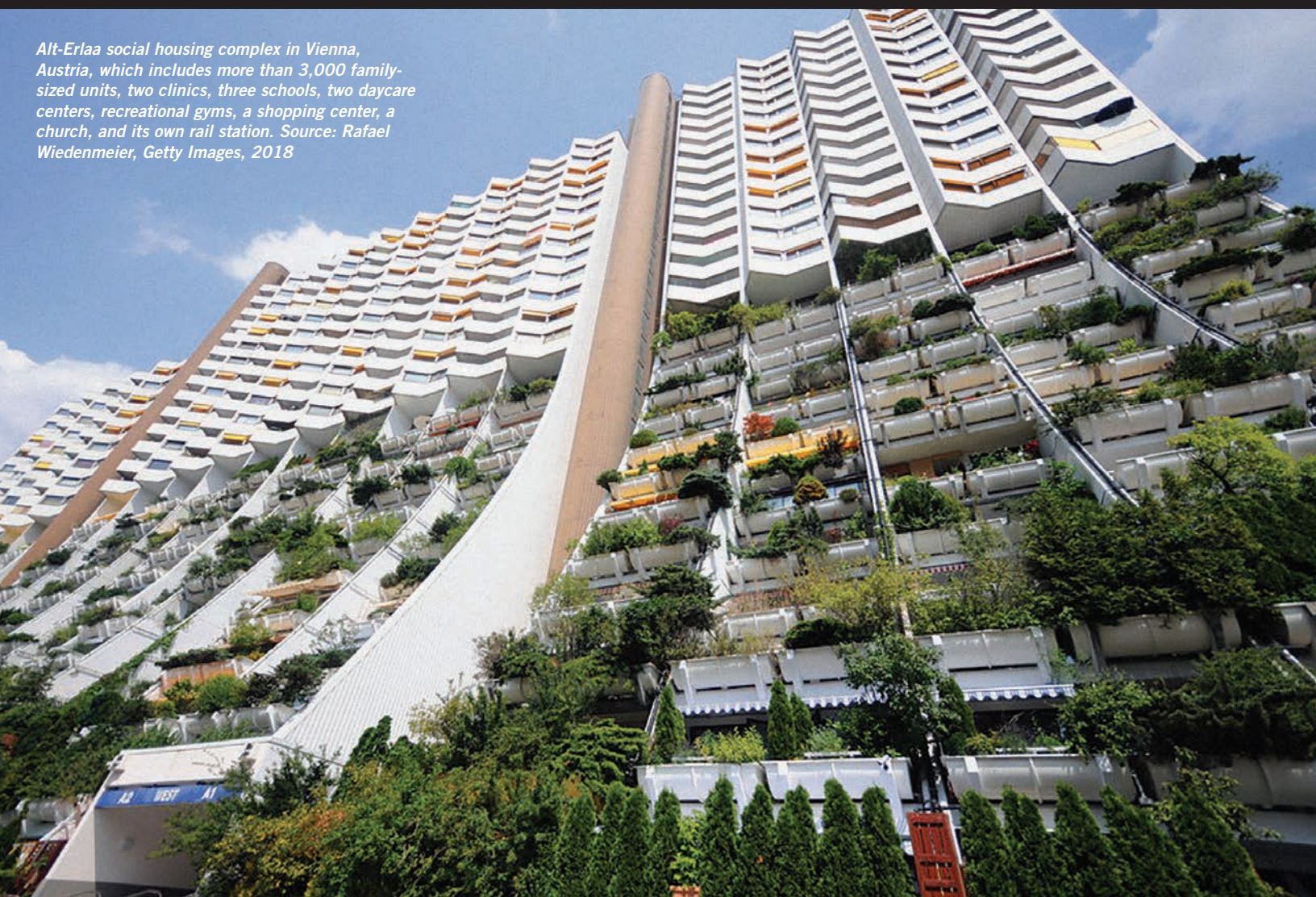
Alt-Erlaa social housing complex in Vienna, Austria, which includes more than 3,000 family-sized units, two clinics, three schools, two daycare centers, recreational gyms, a shopping center, a church, and its own rail station.

invest in their operations and maintenance, allowing them to fall into severe disrepair. 104 At the same time, the FHA refused to insure mortgages in and near Black neighborhoods—a practice known as redlining—which effectively trapped Black residents between racist public and private housing options. Racial covenants also restricted the reselling of private homes to Black, Latinx, and Asian families, preventing them from living in integrated and better-resourced neighborhoods. These laws significantly limited upward mobility and exacerbated the wealth gap between white and non-white families for decades to come.