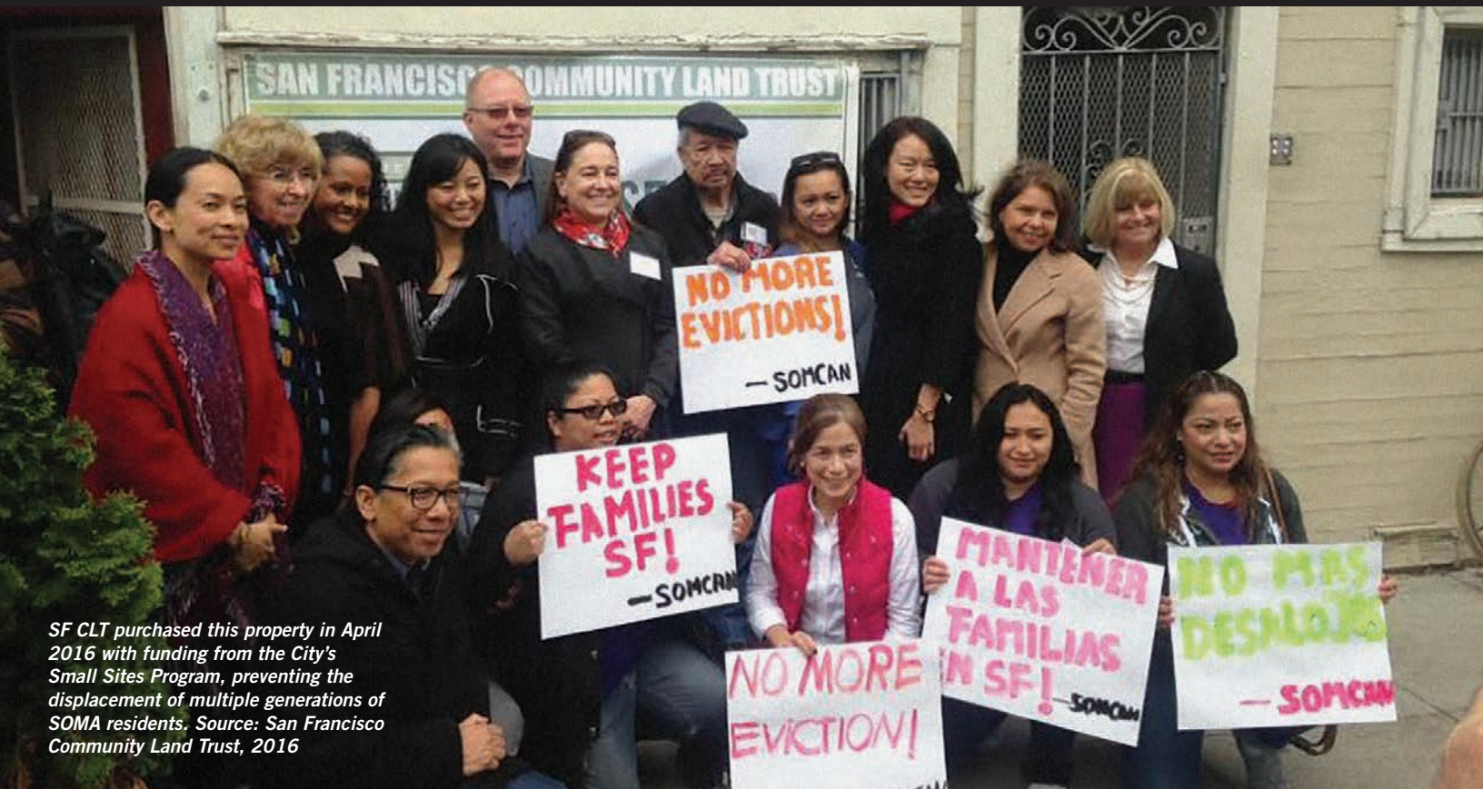
SF CLT purchased this property in April 2016 with funding from the City's Small Sites Program, preventing the displacement of multiple generations of SOMA residents.