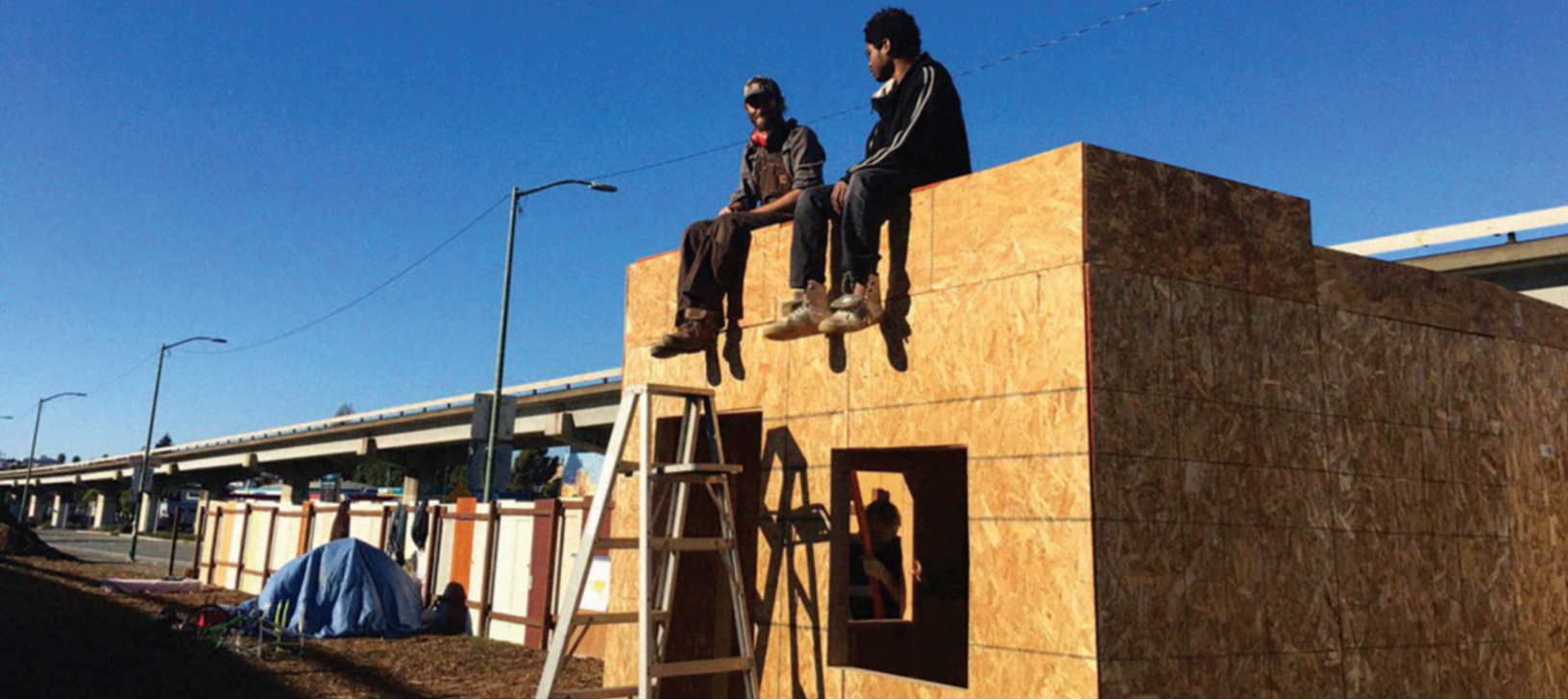
The Village's tiny homes under construction at site in East Oakland.

of cruel and unusual punishment that violates the Eighth Amendment of the U.S. Constitution. 29