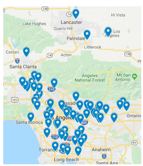
Map of locatable cases in Los Angeles County.