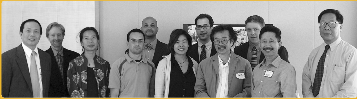
The Pacific Renaissance Team

Union, CJWP, and a pro bono legal team that includes the California Affordable Housing Law Project, Heller Ehrman White & McAuliffe LLP, Paul, Hastings, Janofsky & Walker LLP and Siegel & Yee.