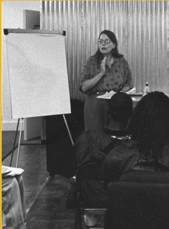
A Community Workshop

In response to these needs and to address the root causes of inequality, EBCLC created a Community Economic Development practice in 1995. This natural evolution to invest in long-term, community initiatives has led to in-depth student involvement in a series of multi-year, large-scale projects described below.