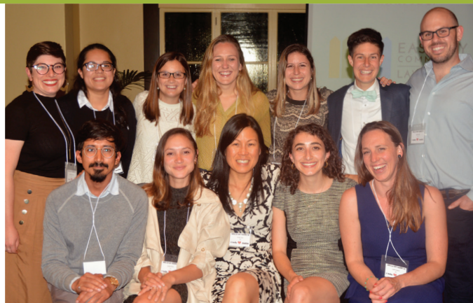
Staff and students in our Immigration Practice at EBCLC's 2017 graduation event

550+ students and immigrant families educated about their rights, and about college options for undocumented students